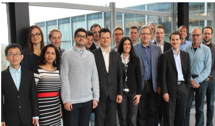
DCSMART Project kick-off meeting was successfully performed by the Delft University of technology in April 2016.

DC distribution grids have the potential to facilitate smart grid applications in a more straightforward way. DC sources and loads could be connected to a DC bus directly, eliminating the need for DC/AC or AC/DC conversions. DCSMART comprises several innovative elements, ranging from the development of smart grid-enabling components to the design of new smart market mechanisms. The DC distribution smart grids will be based on modular and scalable concepts and tested at two demonstration sites, one in the Netherlands and one in Switzerland.